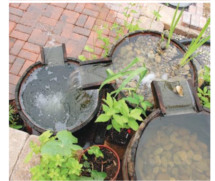
TOP: The three-tiered water element at Beechwood Farms Nature Reserve in Fox Chapel, PA, demonstrates the function of pervious pavers. ABOVE: A 2,000-gallon containment tank sits under the patio and provides the water used for irrigation of the native plant sales area. BELOW: The ever-flowing bird bath is a component of a Complete Aquatics Sustain Rain, rain garden. The crates underground filter and store the water while the pump circulates the water that supplies the bird bath and soaker hoses used for irrigation during dry periods.